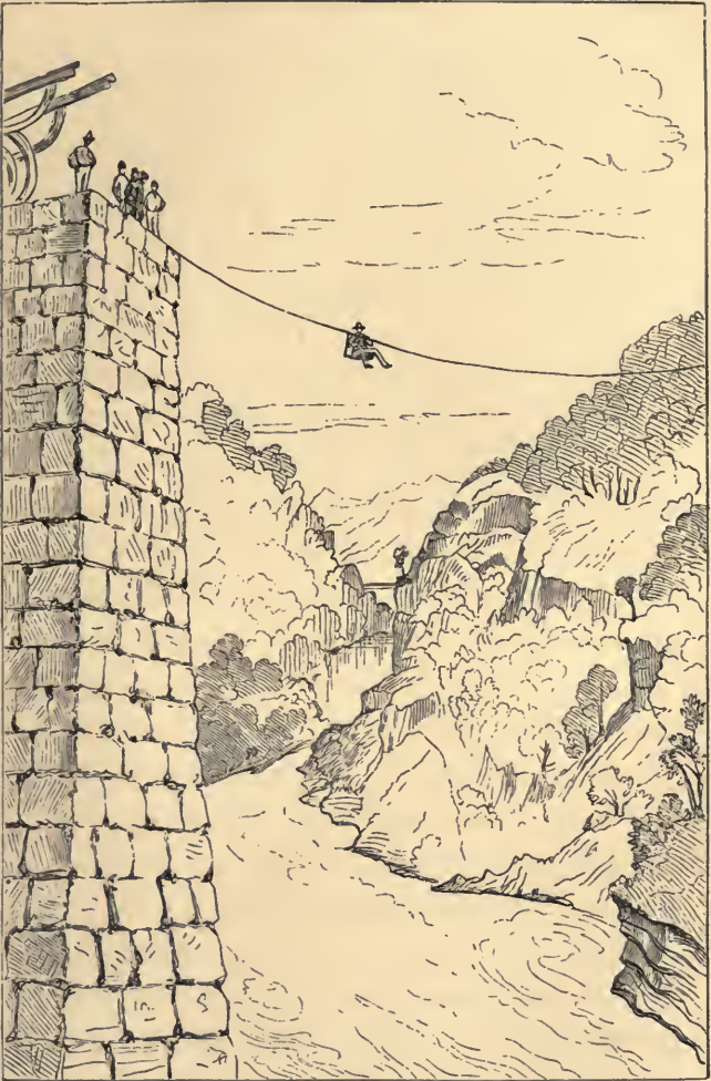
CROSSING THE GREAT FISH RIVER.—PAGE 138.